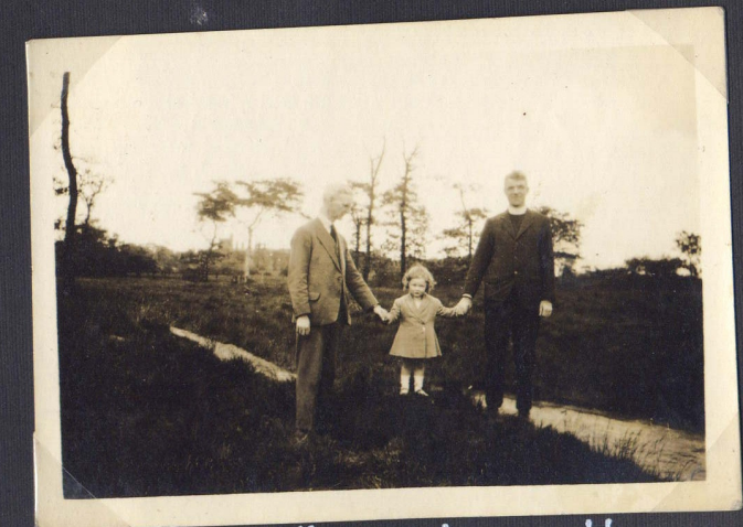
Out for a stroll near LITTLE HULTON.

A page from one of my grandfather's photo albums.