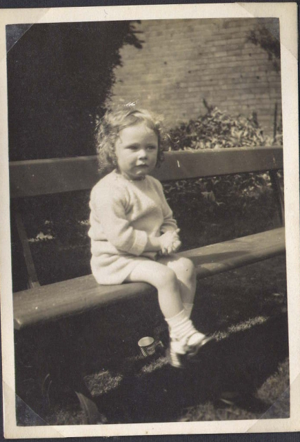
Thinking up some mischief?