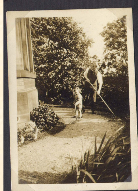
A willing helper.